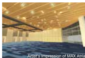
Artist's Impression of MAX Atria