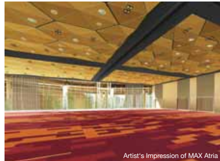
Artist's Impression of MAX Atria

No event is too small or large for our event maestros to handle. From modern audio visual equipment and acoustically-treated walls, to a sophisticated tiered seating system, we have the expertise to create a rewarding business event for you.